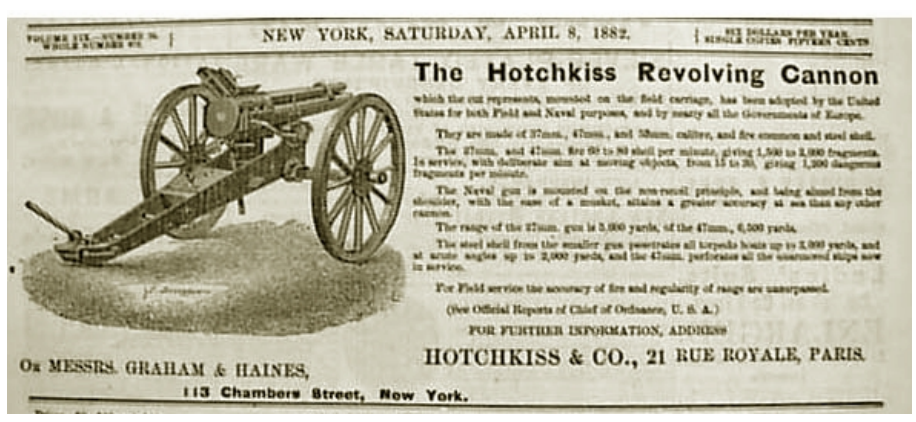
Figure 1.3. Hotchkiss Revolving Cannon

Ideologies of US settler colonialism directly informed Australian settler colonialism. South African apartheid townships, the kill-zones in what became the Philippine colony, then nation-state, the checkerboarding of Palestinian land with checkpoints, were modeled after U.S. seizures of land and containments of Indian bodies to reservations. The racial science developed in the U.S. (a settler colonial racial science) informed Hitler's designs on racial purity ("This book is my bible" he said of Madison Grant's The Passing of the Great Race). The admiration is sometimes mutual, the doctors and administrators of forced sterilizations of black, Native, disabled, poor, and mostly female people - The Sterilization Act accompanied the Racial Integrity Act and the Pocohontas Exception - praised the Nazi eugenics program. Forced sterilizations became illegal in California in 1964. The management technologies of North American settler colonialism have provided the tools for internal colonialisms elsewhere.